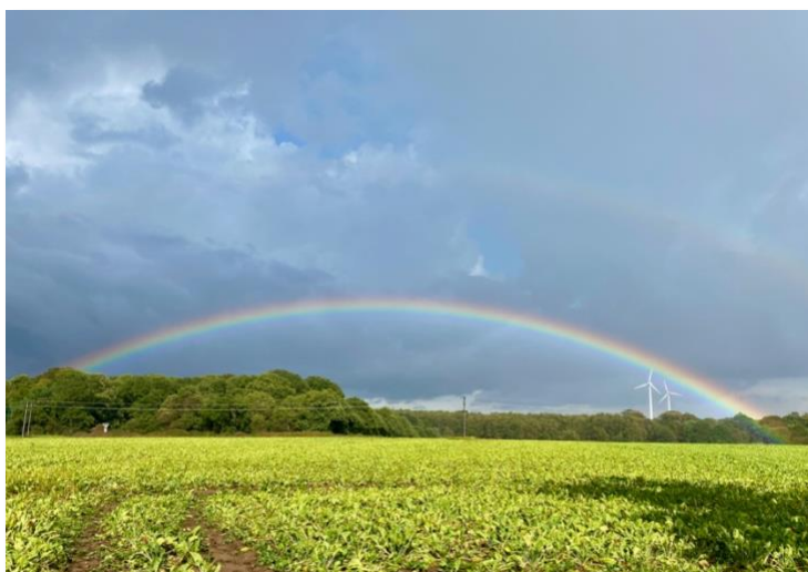
Waldringfield Road August 2020