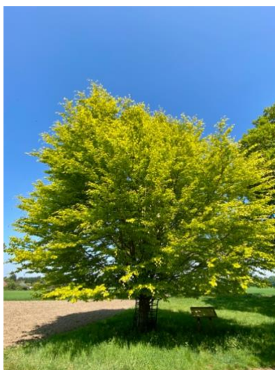
The glories of Spring around the parishes.