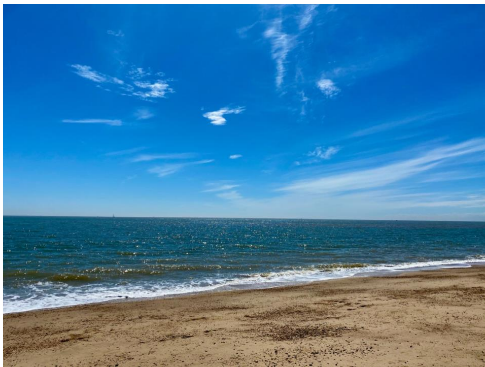
A sunny day at Felixstowe