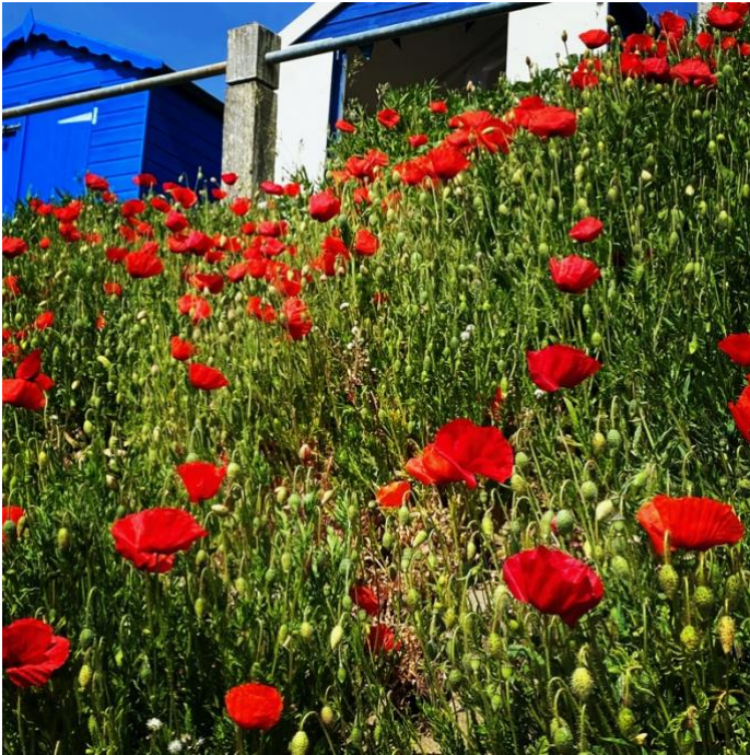
Beach huts and poppies